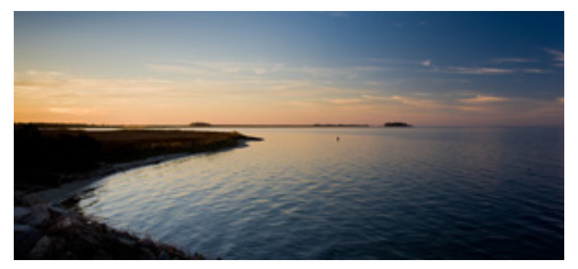
<u>Alligator River National Wildlife Refuge</u>, location of an adaptation project of the US Fish and Wildlife Service in partnership with The Nature Conservancy.