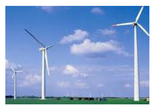
The Center for Sustainable Tourism is also a partner in the The Renewable Energy in Tourism Initiative (RETI). Click <a href="here">here</a> to access the RETI webinar series.

Click <u>here</u> to join the Center's e-mail list to receive future editions of the newsletter.